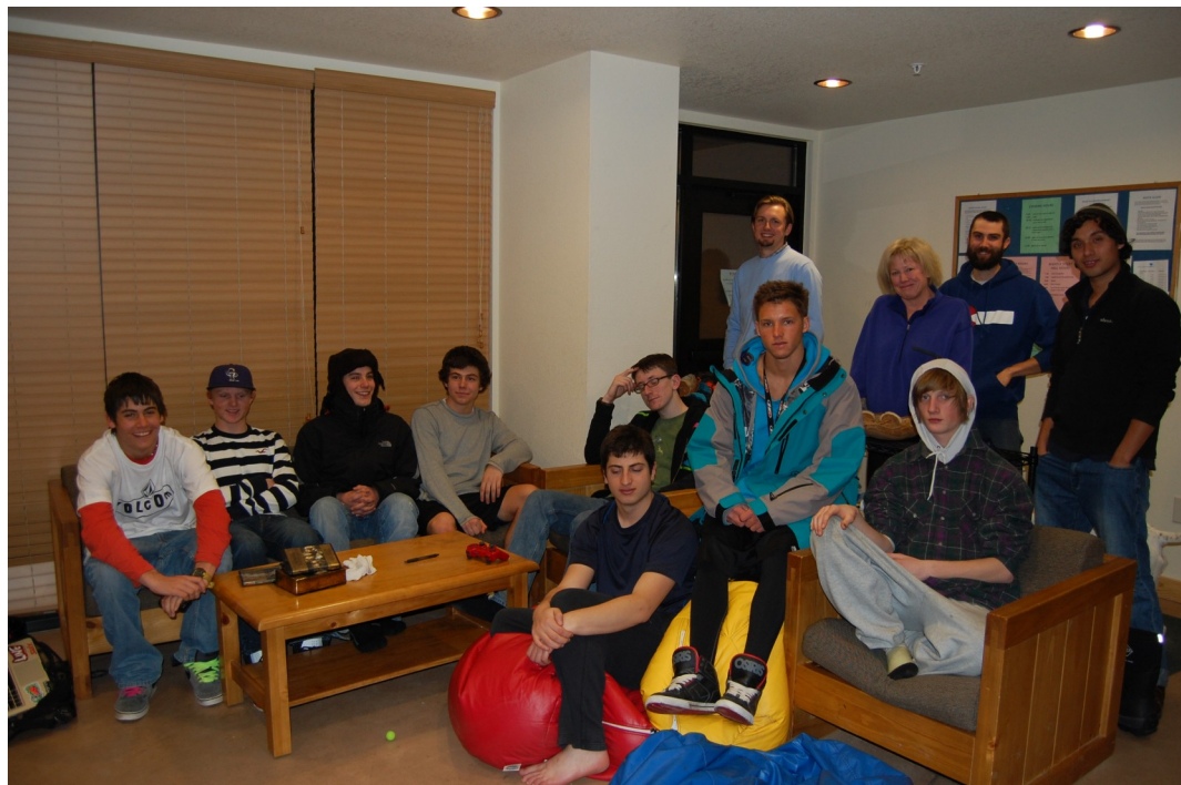
A look at some of the people in the New Boys' Dorm.